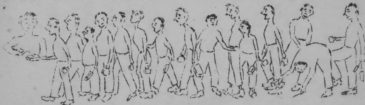
MESS PARADE --AS IT IS --