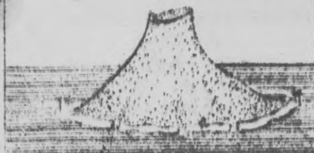
1st Stage: Volcanic Peak surrounded by a fringing reef, i.e. Fongas.