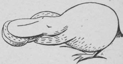
I never knew a Dumkin that Was not both kindly, round and fat. The Dumkin lives on buttered muffins Wherein it differs from the Puffins