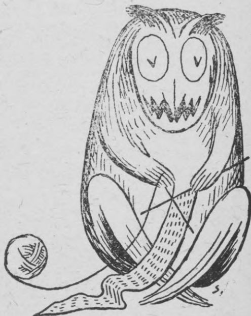
This is that kindly beast the Barmie Who knits the comforts for the Army.