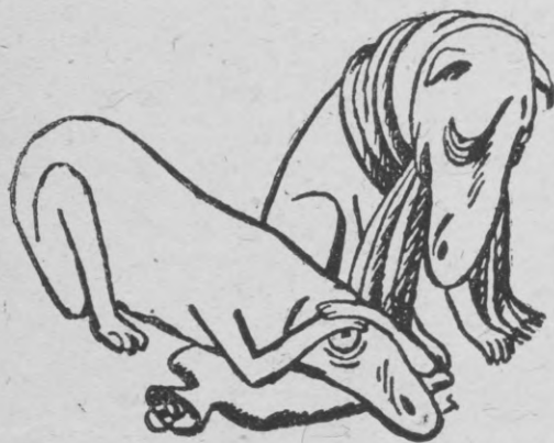
This is a picture of the Sloids They suffer buch frob adedoids.