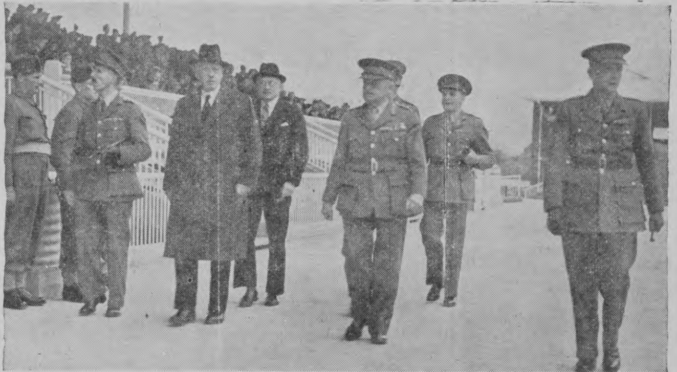
OFFICIAL PARTY ARRIVES —The Prime Minister, Mr. Fraser, and the Inspector-General of the Forces, Major-General Russell (third from left) arriving for the parade.

Woollams Pharmacy, Dilworth Bldg. Queen St., AUCKLAND