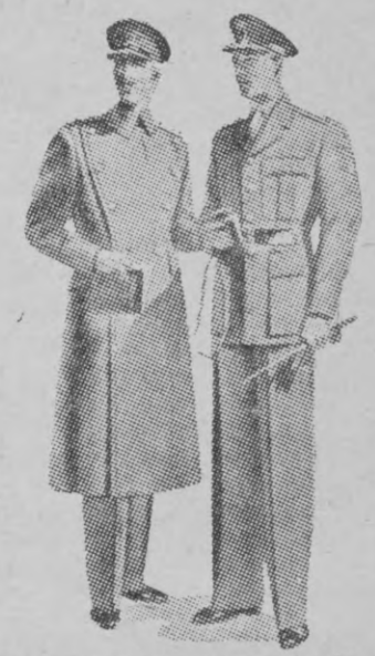
MILITARY TAILORING DE LUXE . . .

We can guarantee you a fine fitting, tailored uniform or greatcoat, beautifully finished, at a reasonable price.