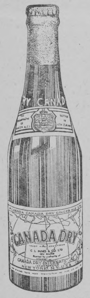
They have the QUALITY