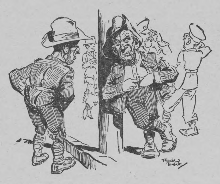
First Soldier (on leave): Can I touch you for a quid, Dig? Second Soldier: For a quid you can punch me ruddy face.