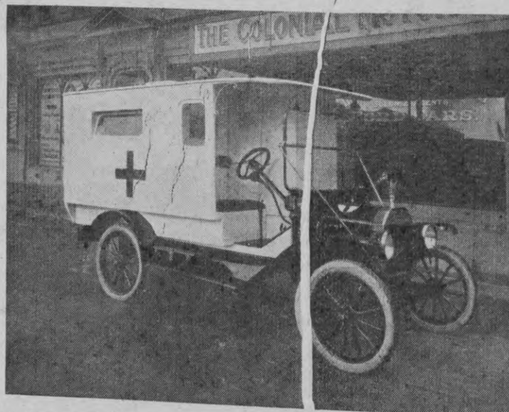
The Last Word in Ambulances in 1914—This Ford Model "T" Ambulance was one of many supplied during the Great War. Compare it with the modern ambulances.