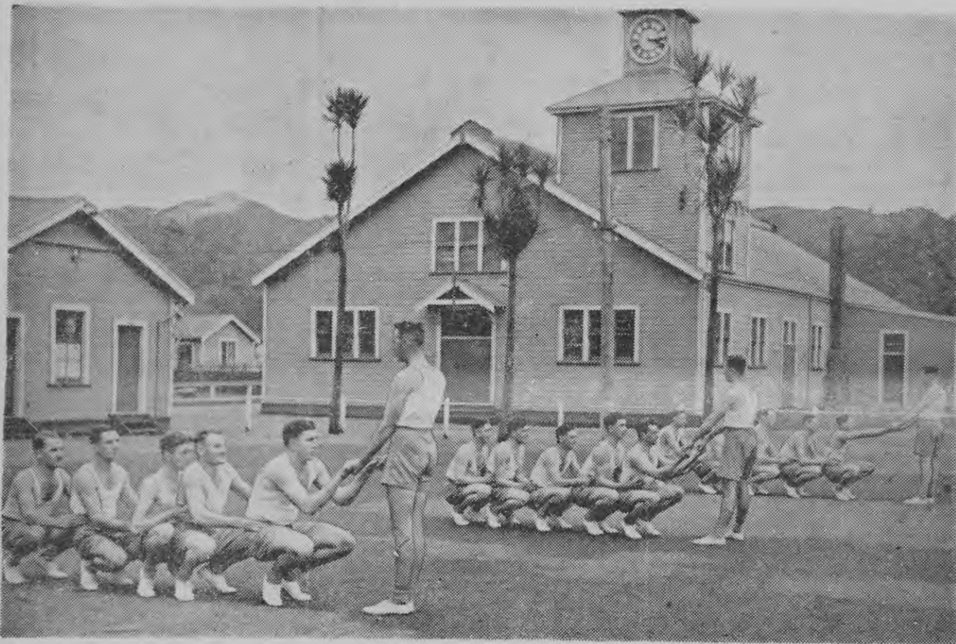
Platoon of men from the New Zealand Regular Forces demonstrating physical training.