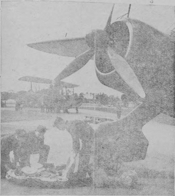
Ground crew by a "Lysander" aircraft preparing a folding rubber dinghy with rations and equipment. In the background a "Walrus" Amphibian is being prepared for rescue work.

Registered as a Newspaper for Transmission by Post at the G.P.O., Wellington.