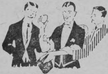
THE EGG BAG TRICK.