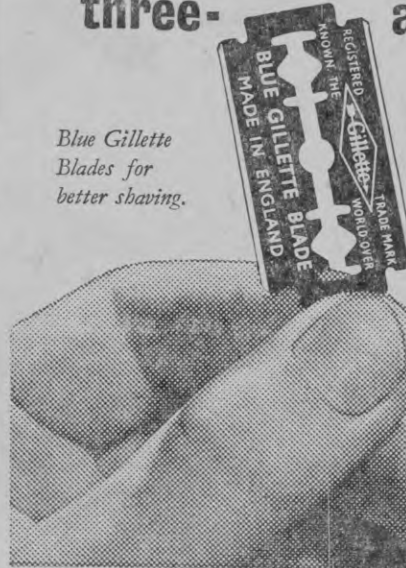
Blue Gillette Blades for better shaving.

The micro-sensitive adjustment of Gillette's machines makes possible the three angles of the Gillette cutting edge. The super-hard steel of the Blue Gillette takes a keener edge and holds it longer. But the cutting edges must be handled carefully. Hold the blade by the ends and every Gillette blade will serve you longer.