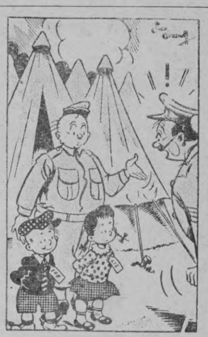
! Sarge, ain't there s ? I've just had billeted on me!" mistake

All enquiries from the Matron, Phone 244, Papakura, Auckland