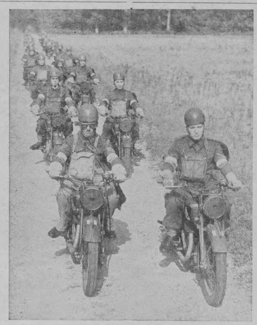
BRITISH DISPATCH RIDERS "Swift and Sure" is the motto of the Royal Corps of Signals of Britain's Army.