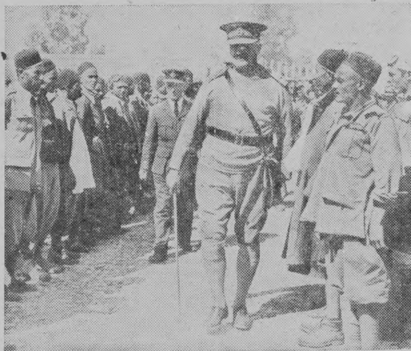
BRITISH COMMANDER IN SYRIA. Lieut.-General Sir Henry Maitland Wilson, who commanded in Syria, inspecting some prisoners.