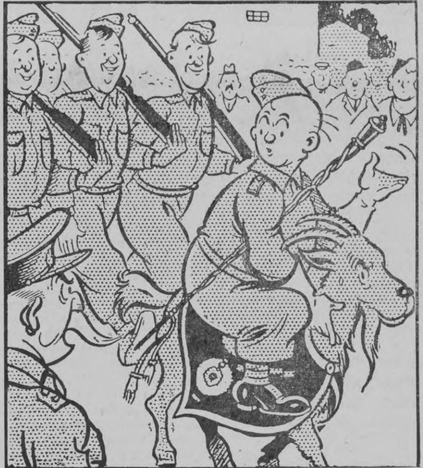
“Mascot or no mascot!—I’m footsore!”