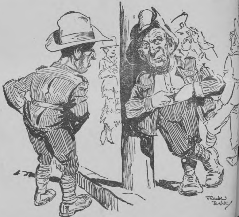
First Soldier (on leave): Can I touch you for a quid, Dig? Second Soldier: For a quid you can punch me ruddy face!