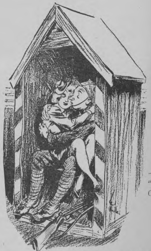
Conscientious Sentry: I'll have to make enquiries to-morrow if I can do this sort of thing on duty!

You can place your order at any of our Branches at PALMERSTON NORTH ... WANGANUI ... NEW PLYMOUTH