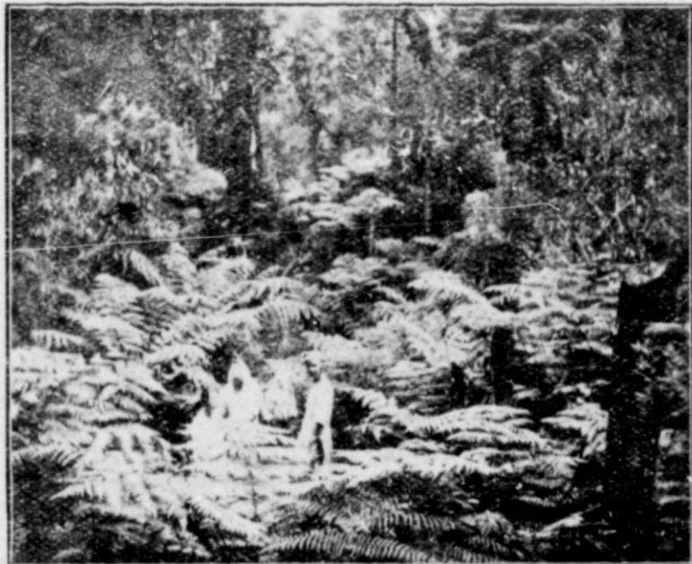
IN TITIRANGI BUSH.