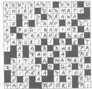
Solution to Crossword Puzzle No. 4