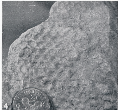
FIGS. 3 and 4.—These unusual honeycomb-like markings are identical with the ichnogenus Paleodictyon . Comparisons can be drawn with P. regulare Sacco (X19, Fig. 3) and P. meneghinii Fuchs (X18, Fig. 4). (Diameter of coin 16mm.)