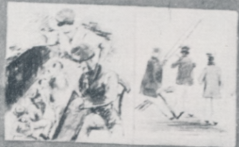
A gentleman with his dog. He is sitting in a chair.