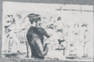
The shipmaster and the crew.