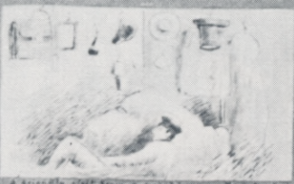
A gentleman still going a mark time. He is bound to make himself comfortable and will take the arms of his hammock.