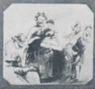
At the end of the day.