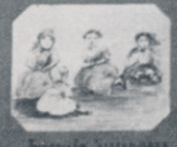
Drugs in the morning.