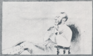
An intermediate sitting in a chair.