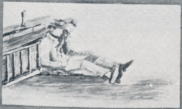
Literature and repose.