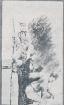
The ship's deck.