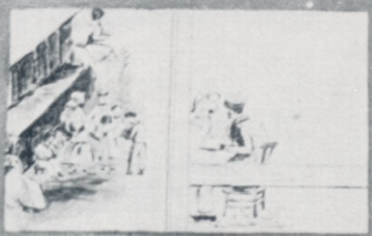
A man in a chair of his own room. He is sitting in a chair.