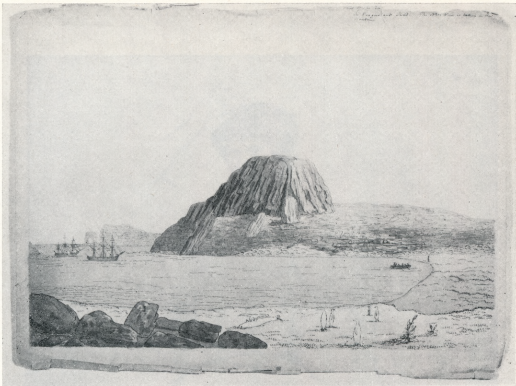
PLATE II Christmas Harbour, Kerguelen Island (f.1)