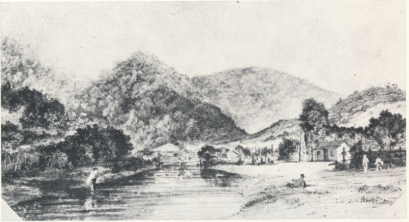
N'Houranga, a watercolour of the Ngauranga stream and gorge, about 1843, showing at centre right the memorial to the chief Te Wharepouri. The engraving in Pictorial Illustrations of New Zealand differs in minor respects from its original, mainly in the arrangement of the figures.