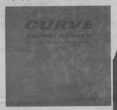
▲ CURVE Doppelganger Enfants terrible of the English music scene, Curve bring technology and good old fashioned distortion together for a mix of ethereality and

noise. An album that's the best candy coated