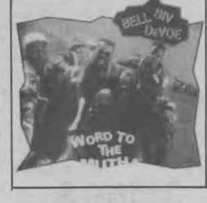
Word To the Mutha!

The B.B.D. boys are back and as funky as ever! This is the latest hit single from their latest hit album, and it's out to get you!