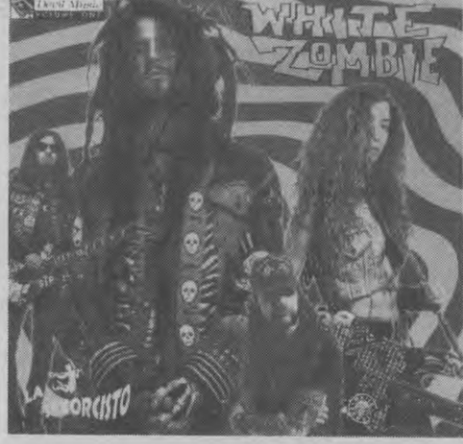
WHITE ZOMBIE La Sexorcisto: Devil Music Vol 1

Rock and Roll is meant to be big, loud, ugly and scary, so here's White Zombie with all that and more. The New York noise merchants latest offering is nothing short of mind altering, with Andy Wallace (Slayer, Rollins Band) doing the production honors. As the Zombie's themselves put it, La Sexocisto is 'Hotter than a Mexican's