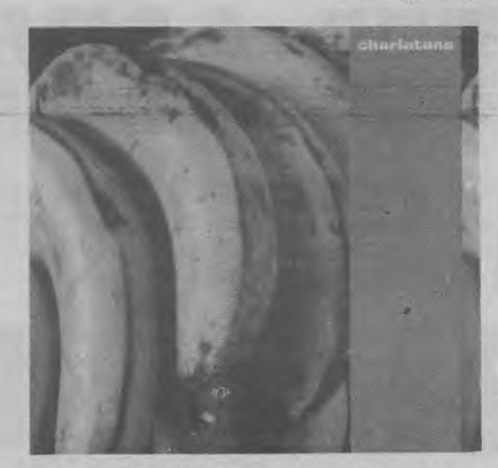
▲ THE CHARLATANS Between 10th and 11th Just when everyone thought the Manchester scene had burned out, the Charlatans have produced their best album yet. Melding 60's melodies, dance beats and modern rock sensibilities, this is a soaring ride through English pop at it's best.