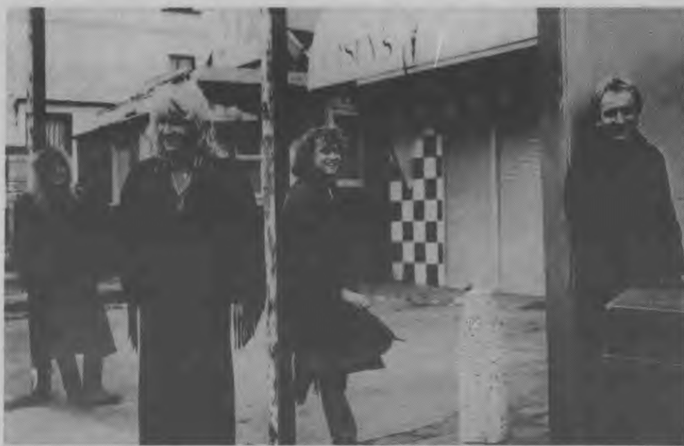
Def Leppard return with 'Adrenalize'. They are (L-R) Rick Savage, Joe Elliot, Rick Allen and Phil Collen.