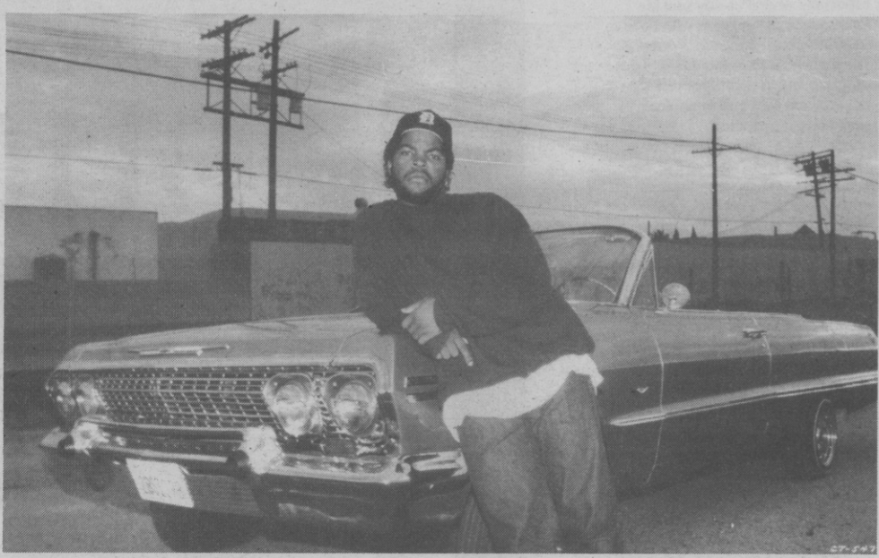
Rapper Ice Cube takes a turn as actor in 'Boyz 'N The Hood', named after the N.W.A. song.