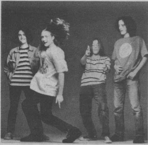
Teenage Fanclub (L-R) Gerry Love, Brendan O'hare, Norman Blake, Raymond McGinley.