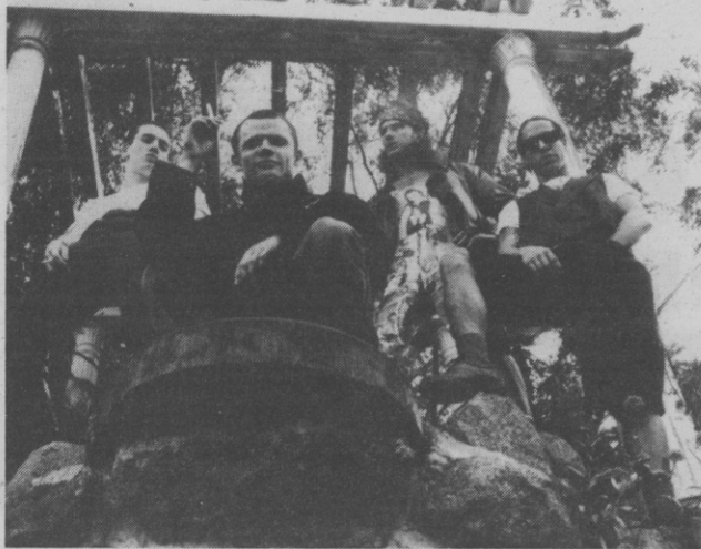
Red Hot Chili Peppers tour late May.