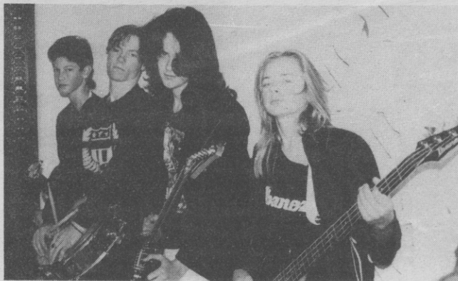
Rock Quest entrants Ransom.

Moana & the Moahunters are currently recording tracks towards an album and doing North Island dates.