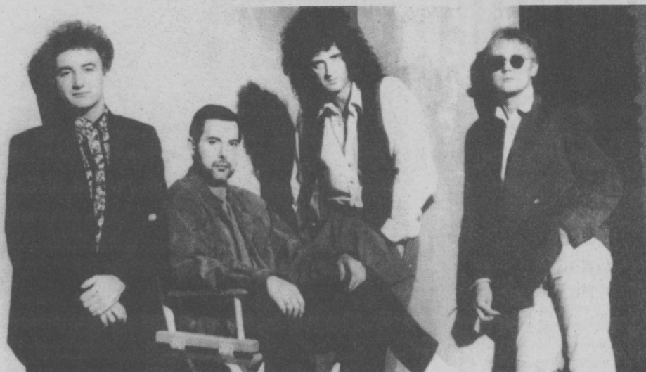
Queen, Brian May second from right.

The song greatly features Brian on his very special custom made guitar. He actually built the instrument himself, using mahogany wood taken from a one hundred year old