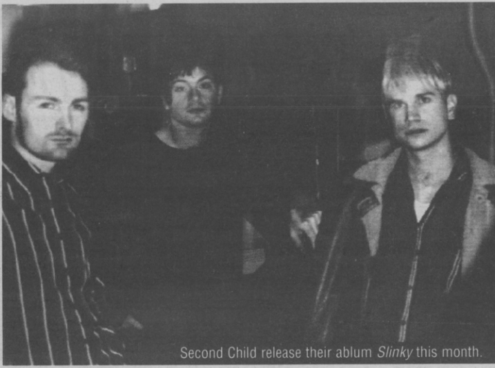
Second Child release their album Slinky this month.

• Columbia have signed Offspring to a multi-million dollar, four album deal. Epitaph will retain at least European rights to the band's next album. The first Columbia album will be later this year.