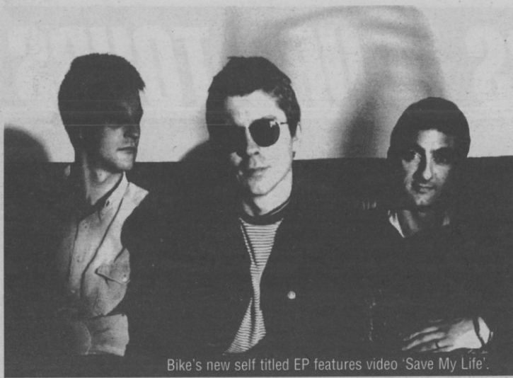
Bike's new self titled EP features video 'Save My Life'.