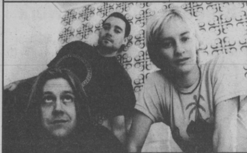
Spiderbait with TISM Powerstation April 27.