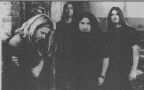
Fear Factory. April 17 Powerstation.