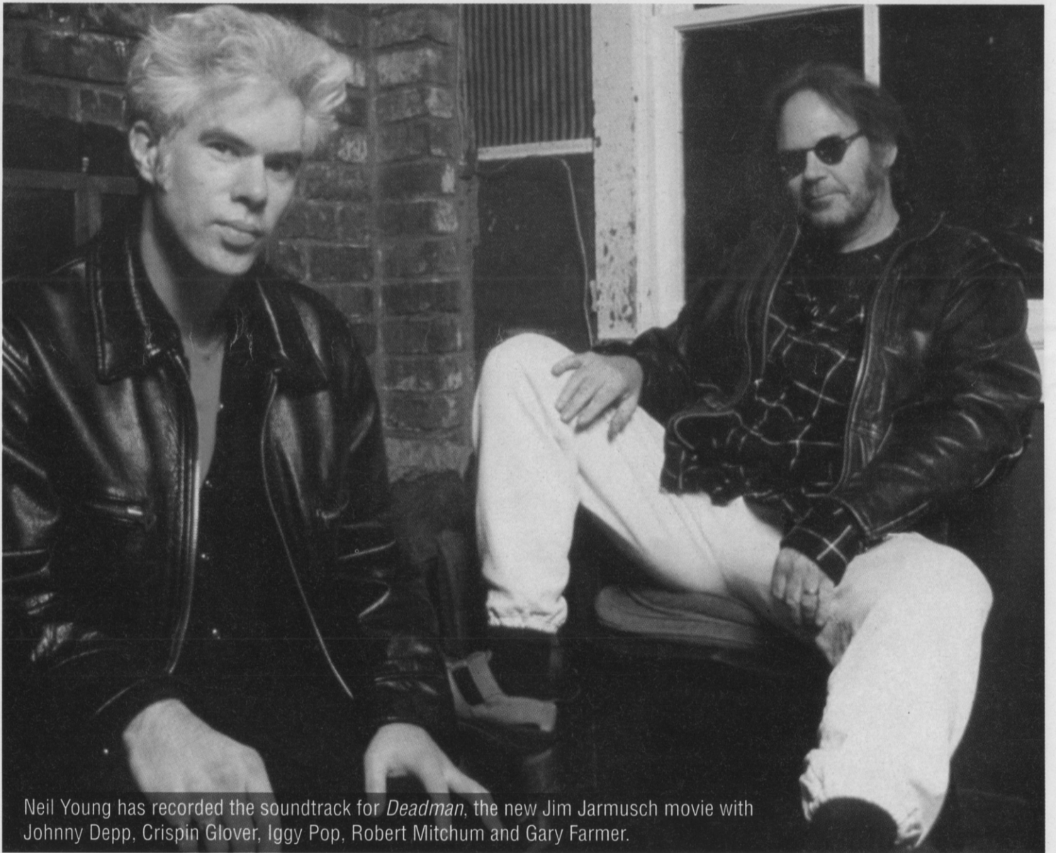
Neil Young has recorded the soundtrack for Deadman , the new Jim Jarmusch movie with Johnny Depp, Crispin Glover, Iggy Pop, Robert Mitchum and Gary Farmer.