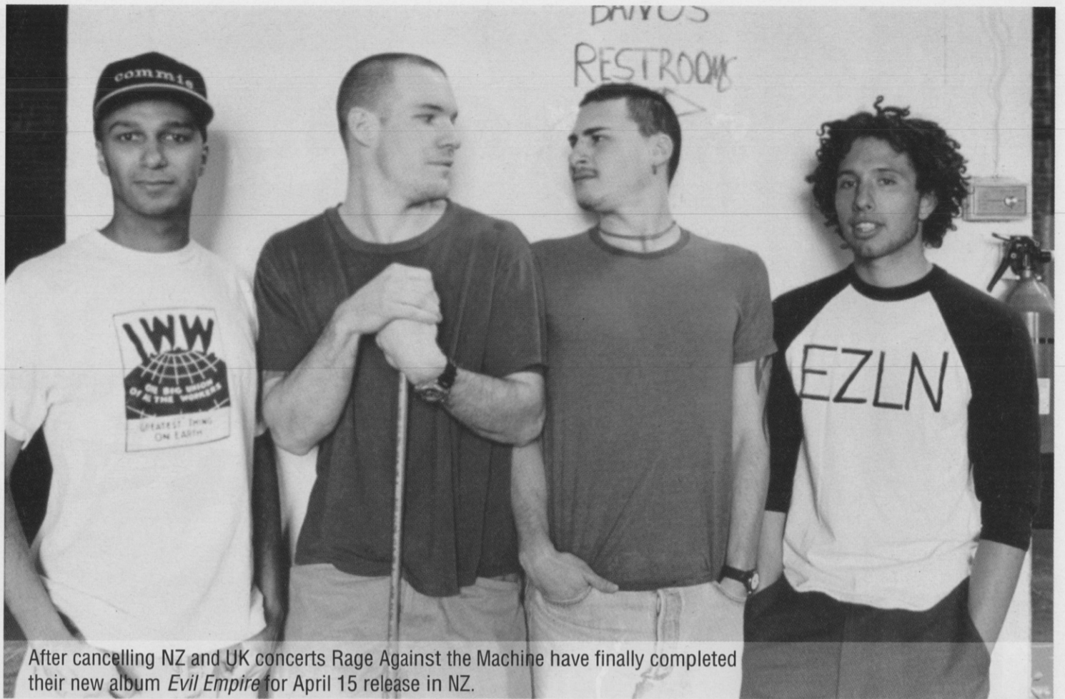
After cancelling NZ and UK concerts Rage Against the Machine have finally completed their new album Evil Empire for April 15 release in NZ.

Al Jourgensen backgrounds the happy birth of the now defunct Revolting Cocks (they apparently "ran out of beer").