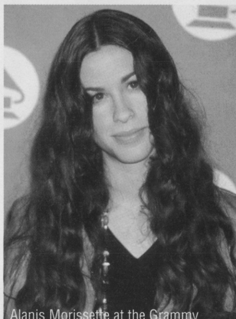
Alanis Morissette at the Grammy Awards. Alanis plays NZ on May 7 in Auckland and May 8 in Wellington.