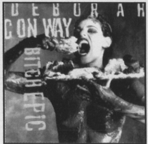
DEBORAH CONWAY BITCH EPIC "This is a collection of distinctive, well crafted pop that is neither high in calories nor risks decay to the molars" NZ HERALD