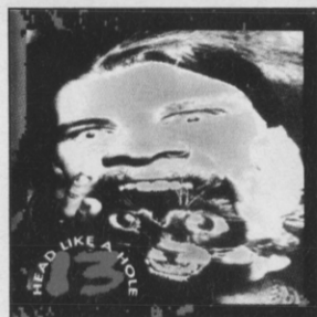
HEAD LIKE A HOLE 13 Noise, nakedness and narcotics — that's Wellington's Head Like A Hole. New album Flik Y'Self Off Y'Self coming soon!