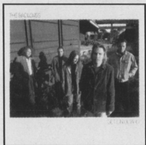
THE BADLOVES GET ON BOARD Not afraid to acknowledge the musical debts of the past, the Badloves push their sound into tomorrow.