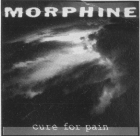
MORPHINE CURE FOR PAIN Drums, Sax and Two-String Bass — the unique sound of Morphine is big.