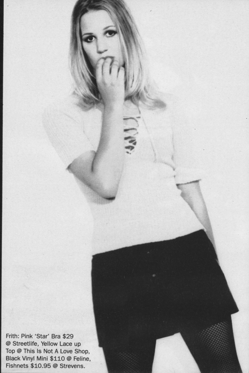
Frith: Pink 'Star' Bra $29 @ Streetlife, Yellow Lace up Top @ This Is Not A Love Shop, Black Vinyl Mini $110 @ Feline, Fishnets $10.95 @ Stevens.