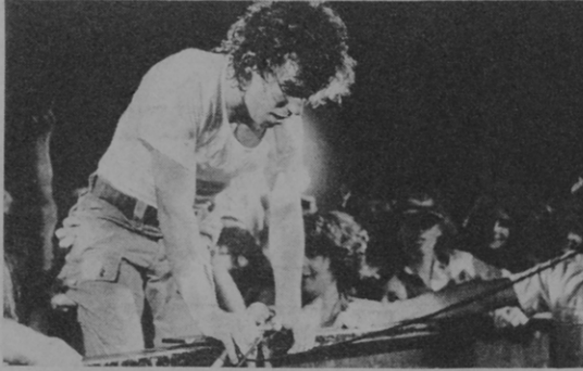
Cold Chisel's Jim Barnes, Sweetwaters '81.

With their 4 NZ concerts, Sept 20-24, Cold Chisel commence their final Australasian tour. They sold 9,000 tickets in 3 hours for their Sydney shows. Drummer Steve Prestwich who recently quit the band will be with them on this final tour.