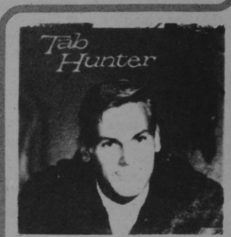
INTERESTING RECORDS PAGE 25

- 1955 and you couldn't expect worse. Bring back Dr Phibes. Anyrate, the Auckland Film Festival is bringing a good one - Creepshow. Friday, July 21, 11pm - see you there. 'ARRY