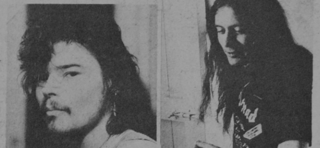
Motorheads' Philthy Animal Taylor and Fast Eddie Clarke. We just jam and then tape the jam and then I write the lyrics over it.

'LEMMY' CONTINUED FROM PAGE 11 is creating their own little fashions." "Are you resentful of bad reviews?" "No, a lot of critics came round when they realised we weren't going to go away and when we proved we were popular." "What do you think of the sexist accusations against heavy metal bands?" "If we were sexist then would we have taken Girlschool on tour?" The point's been missed but I let it go. "What is the Motorhead philosophy?" "We don't have a philosophy except 'enjoy yourself'. We just do what we want to do. I'm just saying have a good time." I'm vaguely familiar with the Motorhead album product, the best being their last studio effort, Ace of Spades , where everything is nailed down with customary muscle. But Motorhead differ from others of their creed in that their music is brutally honest, and although it's macho, it isn't without a certain rough humour. That can't be said for most of their colleagues. Anyway, I've always had this theory that anyone can write a heavy metal song, so I ask Lemmy how Kilmister-Clarke-Taylor write theirs. "The three of us write the music and I write the lyrics."