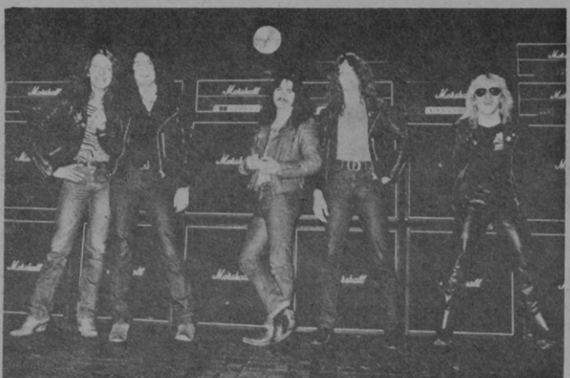
Tygers Of Pan Tang