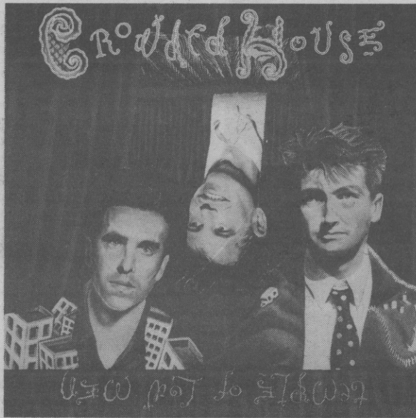
CROWDED HOUSE TEMPLE OF THE LOW MEN