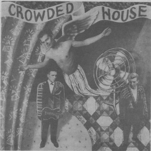
CROWDED HOUSE CROWDED HOUSE