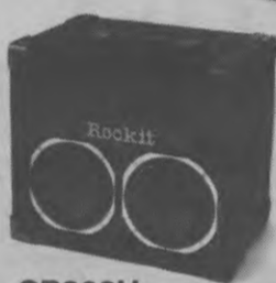
SP208H 200w RMS (400 x 430 x 350mm)

New Generation computer aided design, PA, Keyboard speaker systems using FANE Studio Series drivers. Compact yet powerful and efficient.