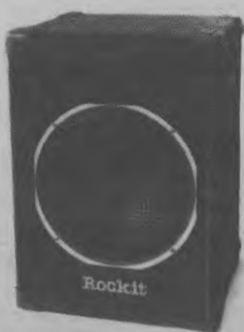
SP115H 200w RMS (440 x 490 x 670mm)