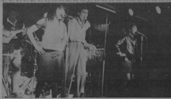
42nd Street, Club New York.