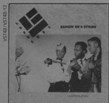
LOOSE ENDS Hanging On A String (Contemplating)