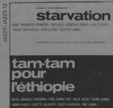
STARVATION Starvation/Tam Tam Pour L'Ethiope

Artists include; UB40, Madness, Pioneers, Specials, General Public, King Sunny Ade, plus many many more.