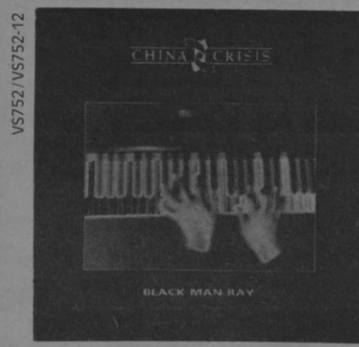
CHINA CRISIS Black Man Ray

Artists include; UB40, Madness, Pioneers, Specials, General Public, King Sunny Ade, plus many many more.