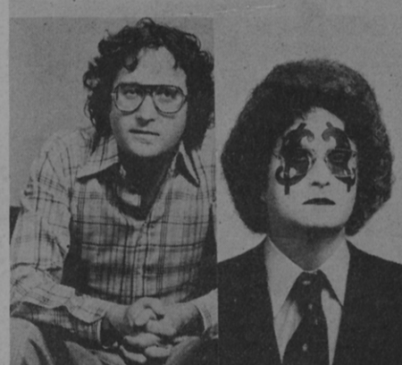
Randy Newman, before and after.