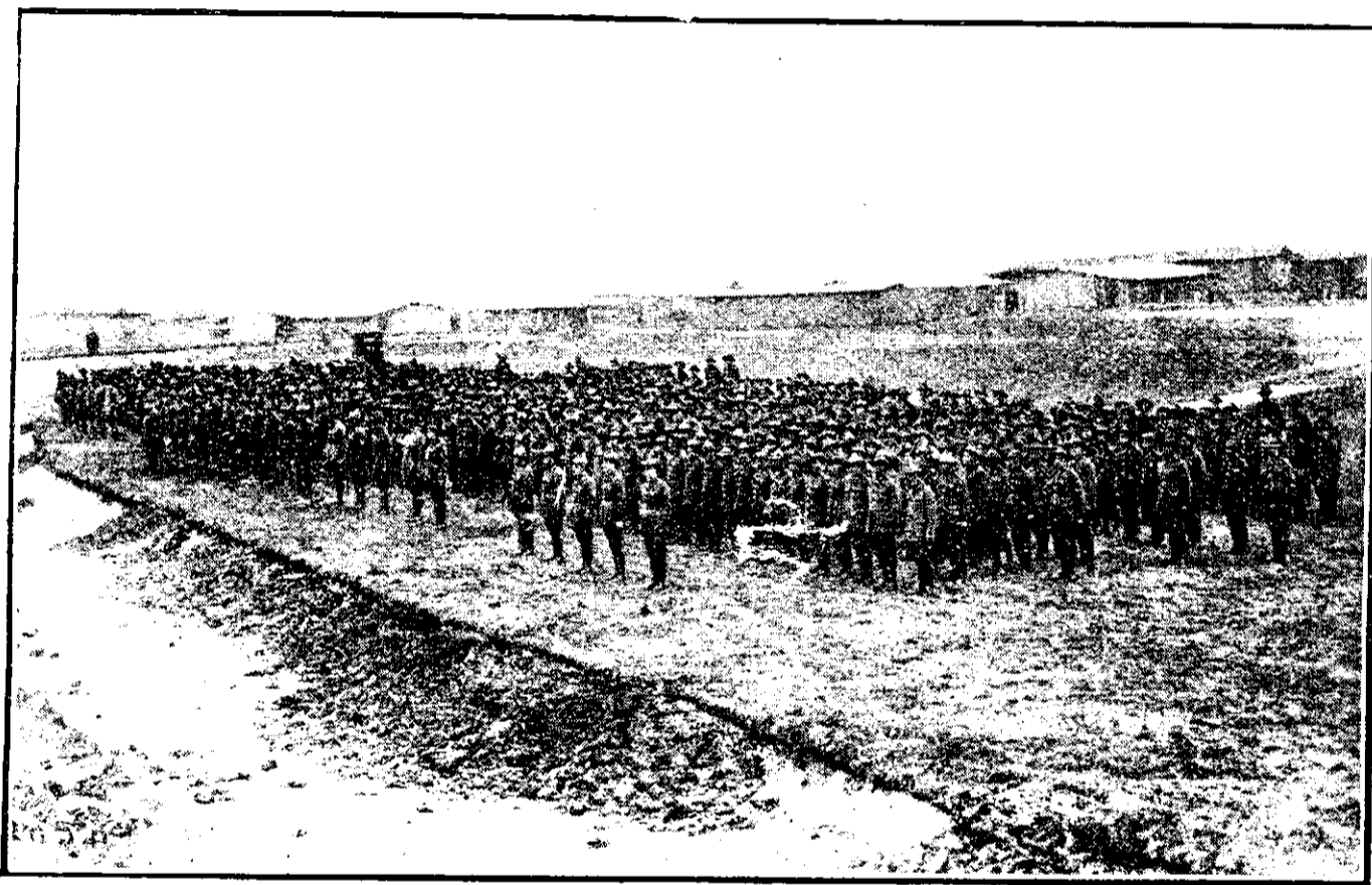
Konga moreru ote Ope Maori i whakaahua tika ki Ingarangi i mua ta ta atu ote ratou hokinga mai.