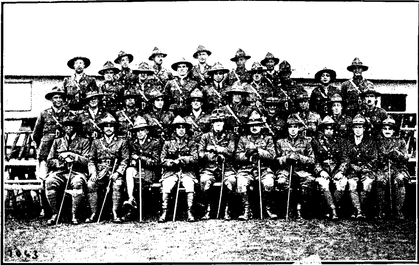
Konga morehu tanga ake ote ropu onga Ap'ha... kaore i uru kite whakaahua nei, engaro ke... tenei whaka-