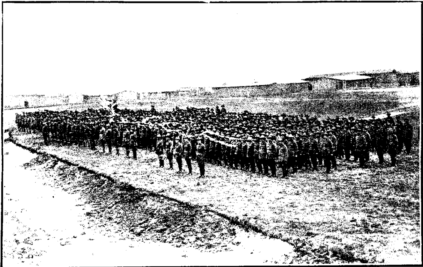
Konga morehu ote Ope Maori i whakaaahua i te ki Ingarangi i mua ta ta atu ote ratou hokinga mai.