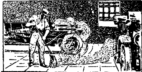
Smooth-on prevents dust in Garages.

Constant attrition, changes of temperature, gasoline, oils, water, etc., quickly cause Garage floors to disintegrate and crumble. SMOOTH-ON Iron Cement No. 7 will make a garage floor Wear-proof and practically everlasting.