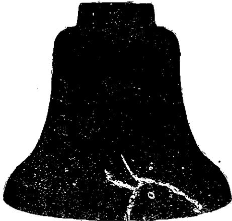
Municipal Firebell, weight 2½ cwt., broken and cracked— Repaired by us and tone completely restored

Practically "anything from a needle to an anchor" can be repaired by our OXY-ACETONE SYSTEM OF WELDING