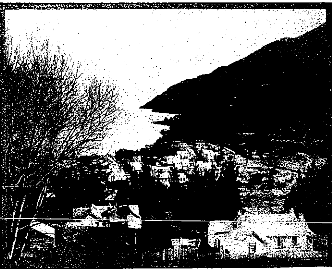
QUEENSTOWN, LAKE WAKATIPU.