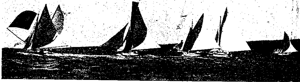
START OF THE CRUISERS.