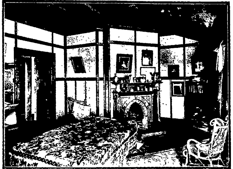
DINING ROOM OF BUNGALOW HOUSE