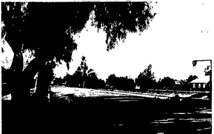
PETROLITHIC PAVEMENT ROAD, GLENDALE, CALIFORNIA.