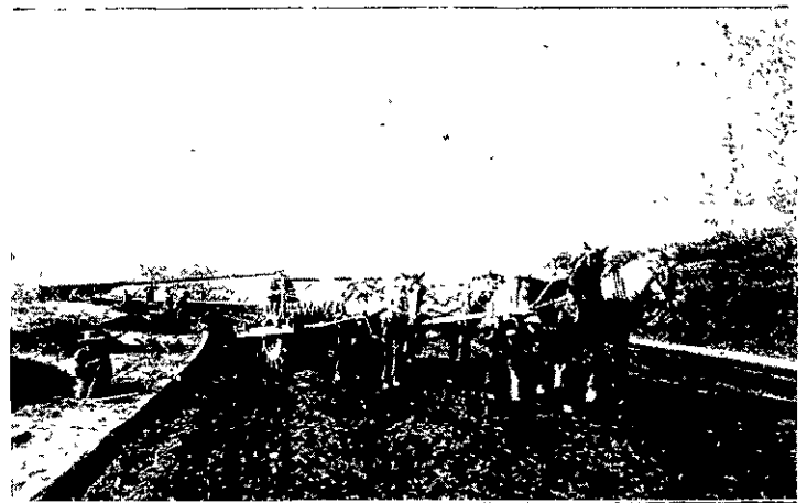
TAMPING LIKE A FLOCK OF SHEEP.