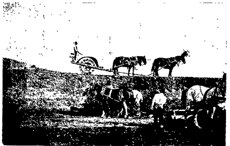
BUILDING A RESERVOIR EMBANKMENT WITH A ROLLING TAMPER.