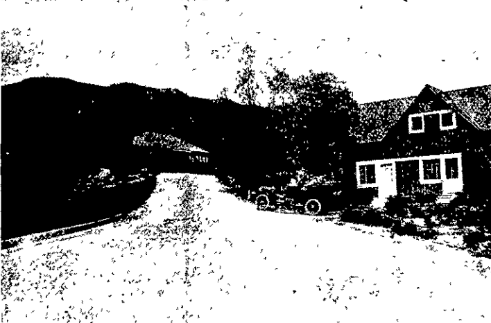
PETROLITHIC PAVEMENT ROAD, MONROVIA, CALIFORNIA