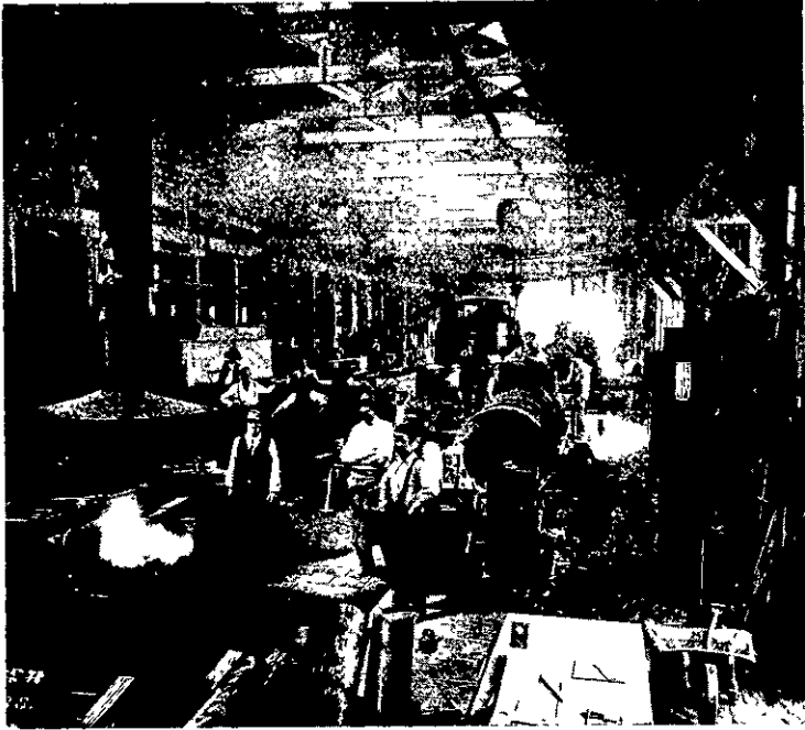
90-TON ENGINE (CLASS X) BUILDING FOR N.I. TRUNK LINE.