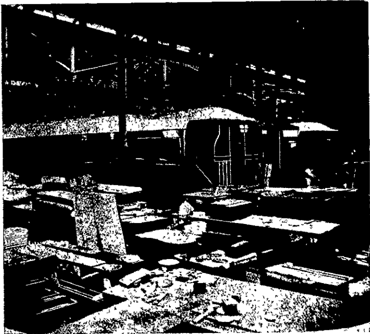
SLEEPING CARS (under Construction)