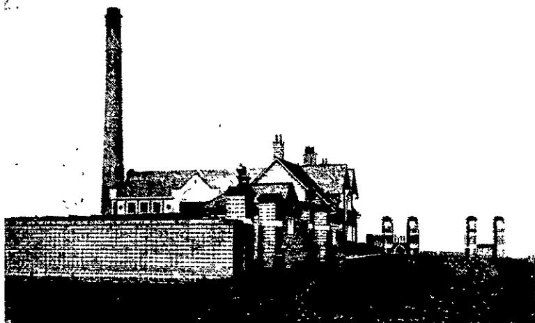
THIS PLANT SUPPLIES POWER TO RAISE THE SEWAGE OF CITY OF BIRMINGHAM.